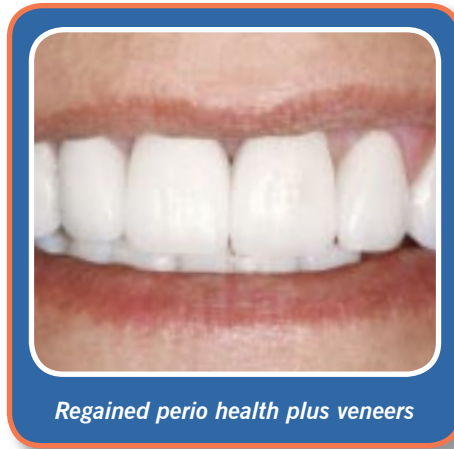
Regained perio health plus veneers

Here are some links that have been demonstrated between oral health and overall health.