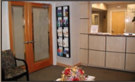
Center For Dental Implants Of South Florida