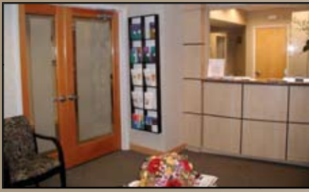
Center For Dental Implants Of South Florida